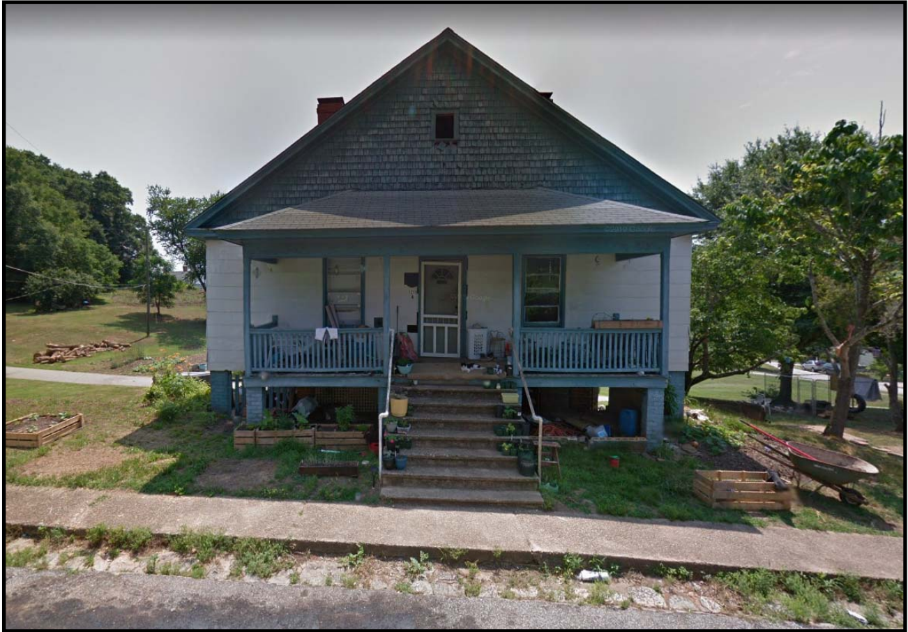
Glass family home on Cleveland Street in Pacolet Mills.