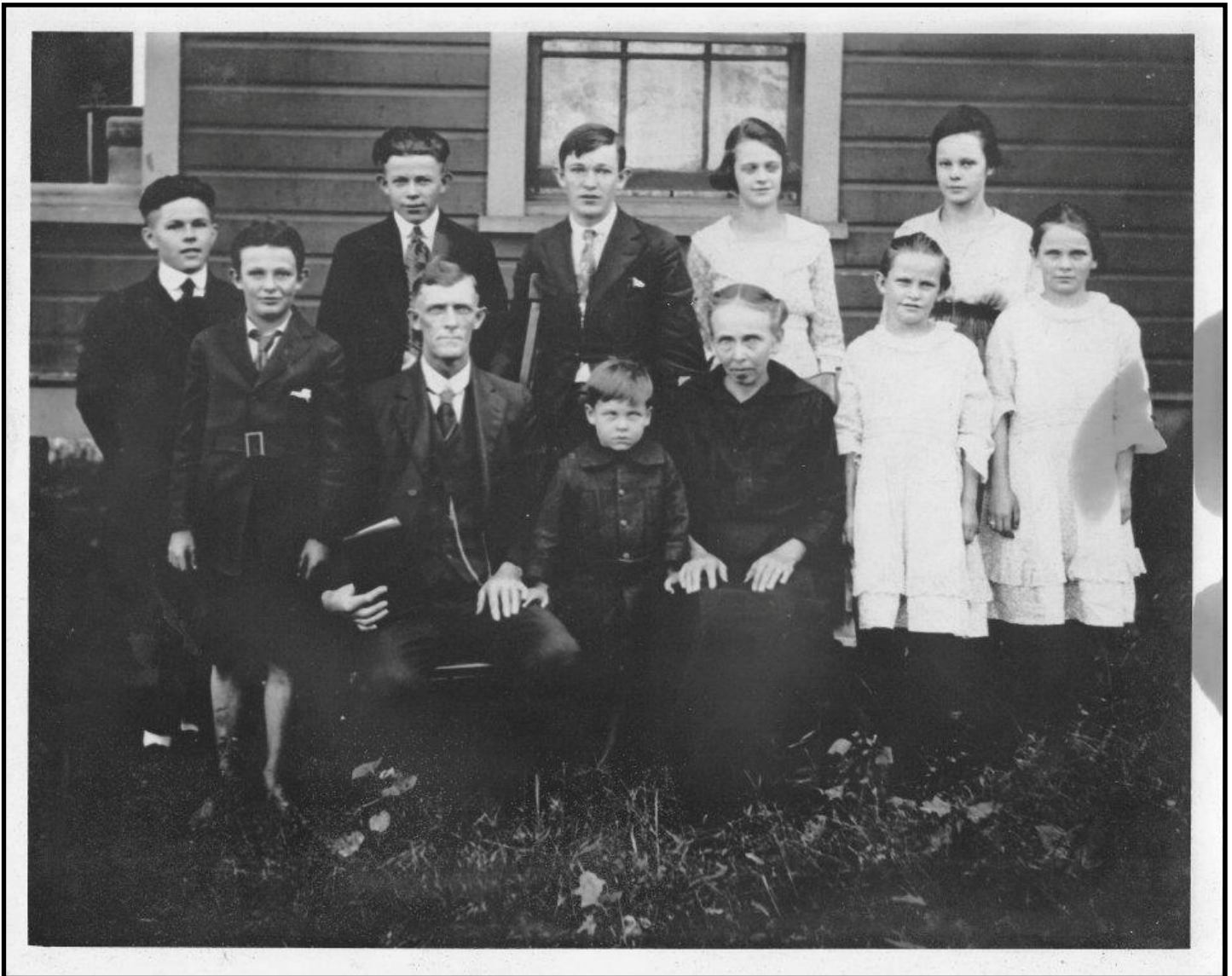
Family Picture in Pacolet Mills beside the Cleveland St House