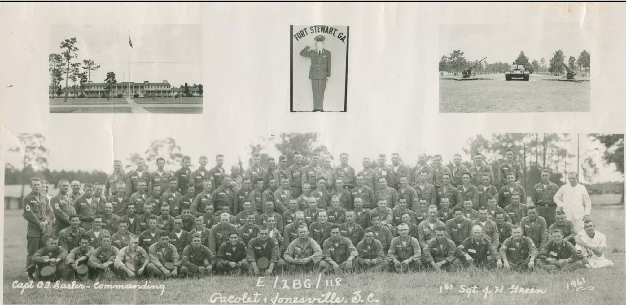
Army National Guard Company from Pacolet and Jonesville in 1961.