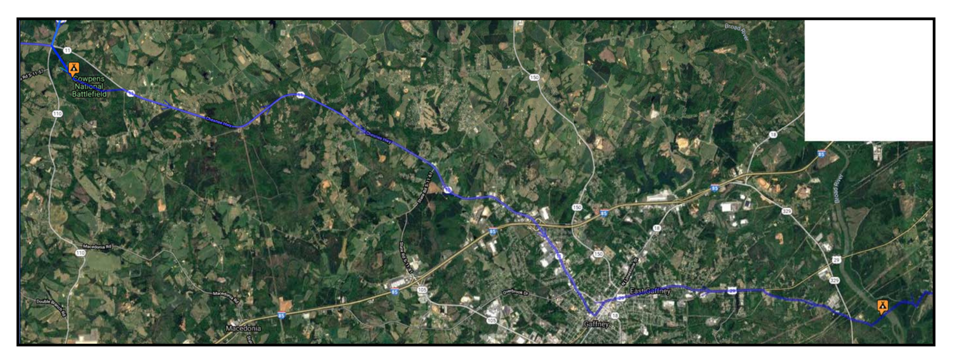
The approximate route of the Americans from Cowpens to the Broad River is marked in blue.